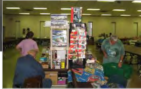
Laurel Lions setting up their Train & Toy Show at the Laurel Fire Hall on October 10, 2009.